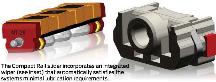
The Compact Rail slider incorporates an integrated wiper (see inset) that automatically satisfies the systems minimal lubrication requirements.