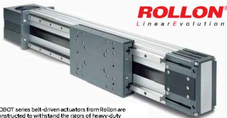
ROBOT series belt-driven actuators from Rollon are constructed to withstand the rigors of heavy-duty packaging applications. Actuators offer speeds to 5 m/s, maximum dynamic axial load capacities from 780 to 5,510 N and stroke lengths from 100 mm to 6 m.

Determine the required stroke length as well as the volumetric envelope the system must fit into. For example, will the actuator be used to move a robot into position? If so, how far will the robot need to travel on its linear path? Or will several actuators be used to create a Cartesian gantry system to move cases around? In certain end-of-line packaging scenarios, it makes sense to build a three-axis gantry system out of heavy-duty rigid actuators to handle heavy loads rather than using a SCARA robot with a more limited payload capacity. In many cases, a gantry system may require the same or less volumetric space than a comparable SCARA robot system.